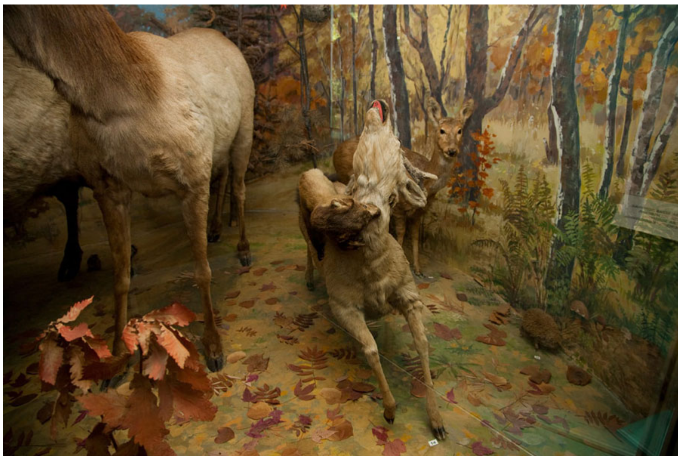
01 – Divine Retribution