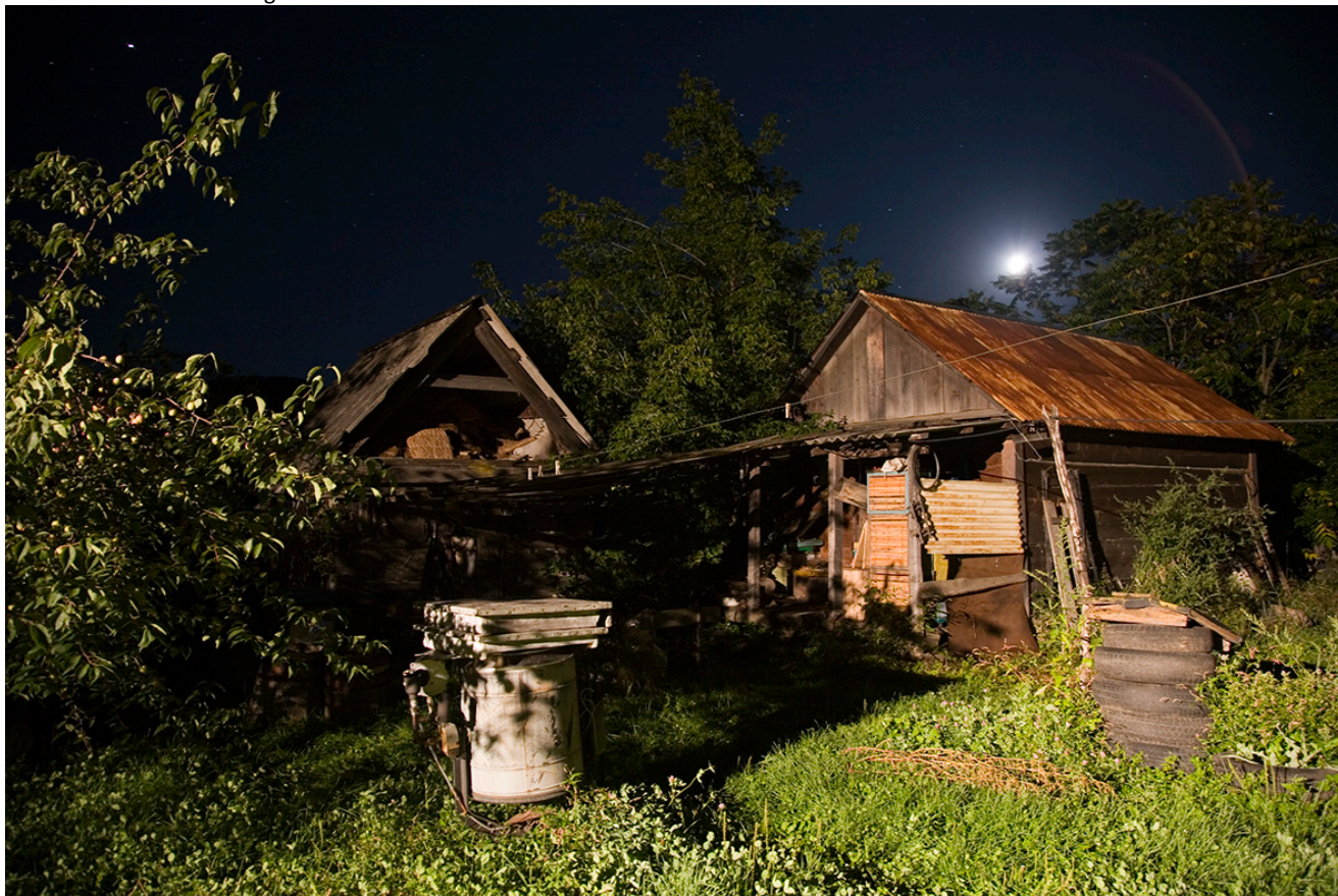
02 – The House of Baba Yaga