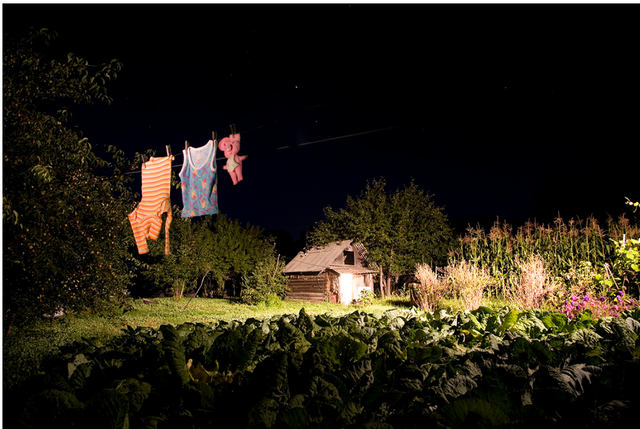
01 - The House of Baba Yaga