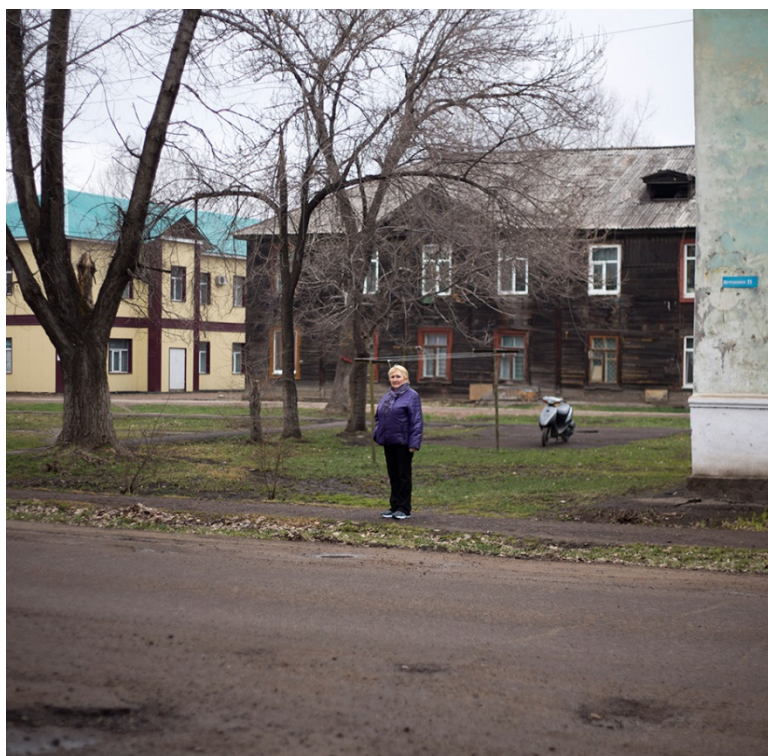
03 – Deleted scene