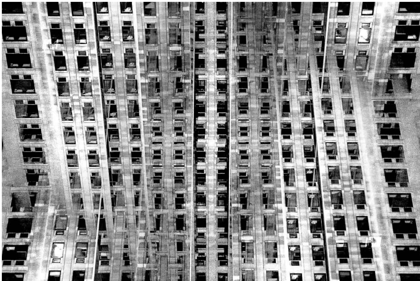
Belvedere, from Metropole (2015)