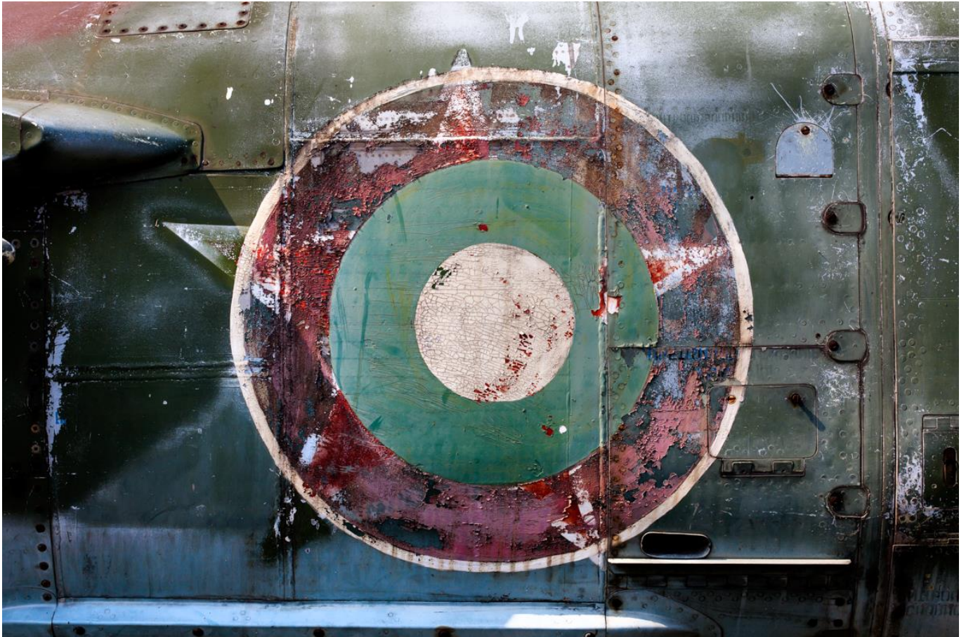
Bulgarian Fighter jet, Sofia, from The Memory of History (2012)