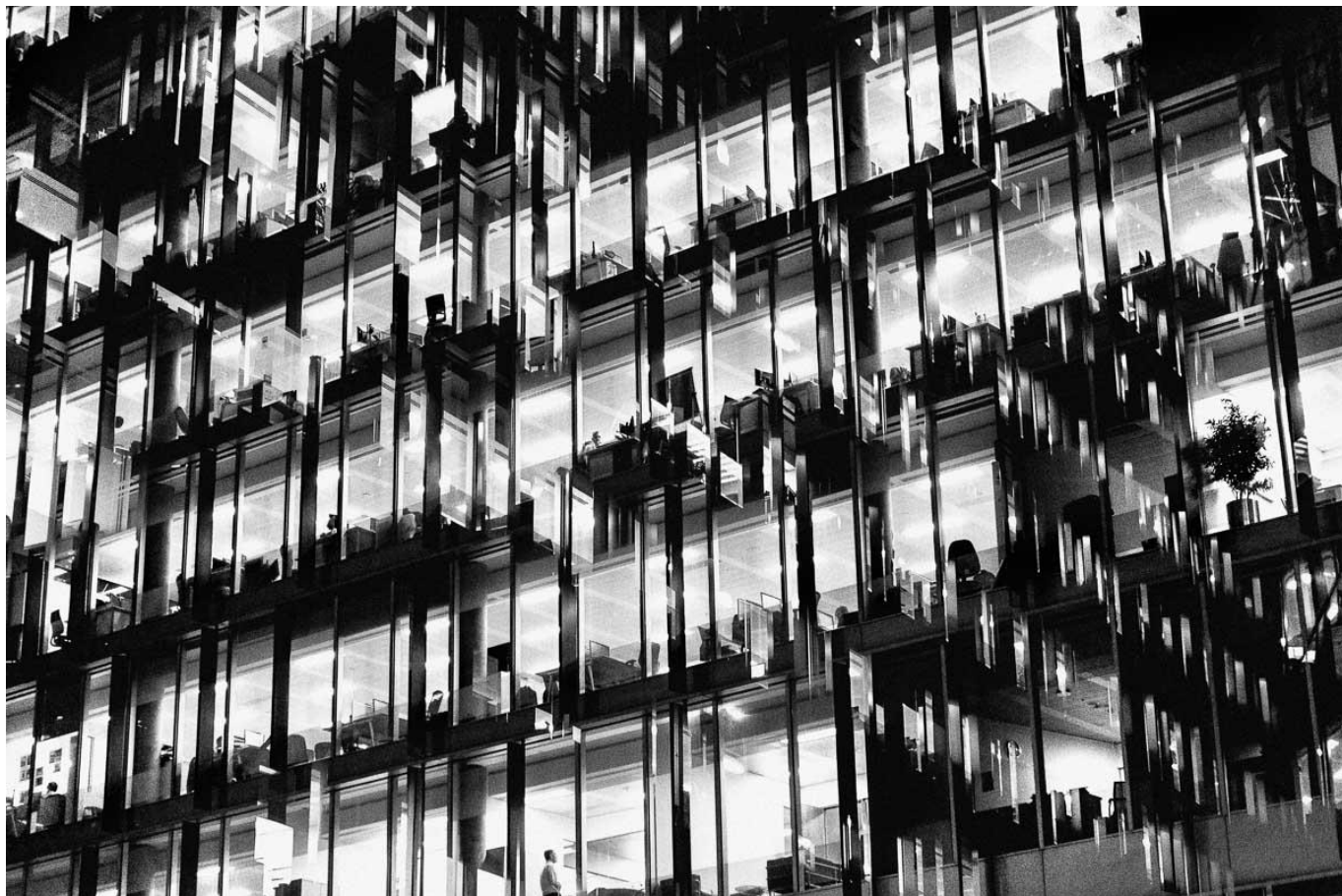
Holland, from Metropole (2015)