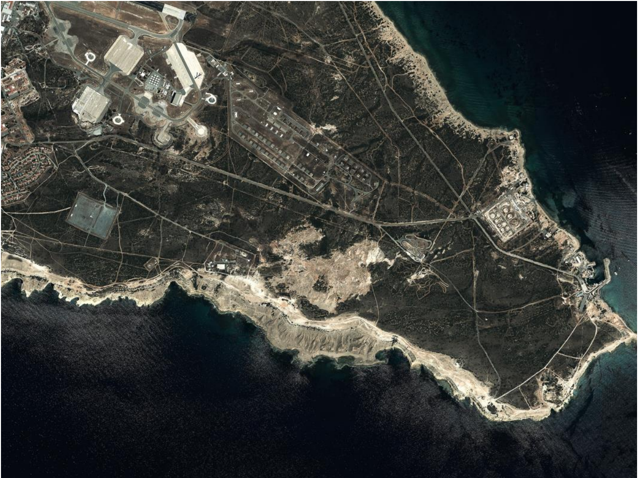
RAF Akrotiri (former clandestine transmitter site) from Shadows of the State (2018)