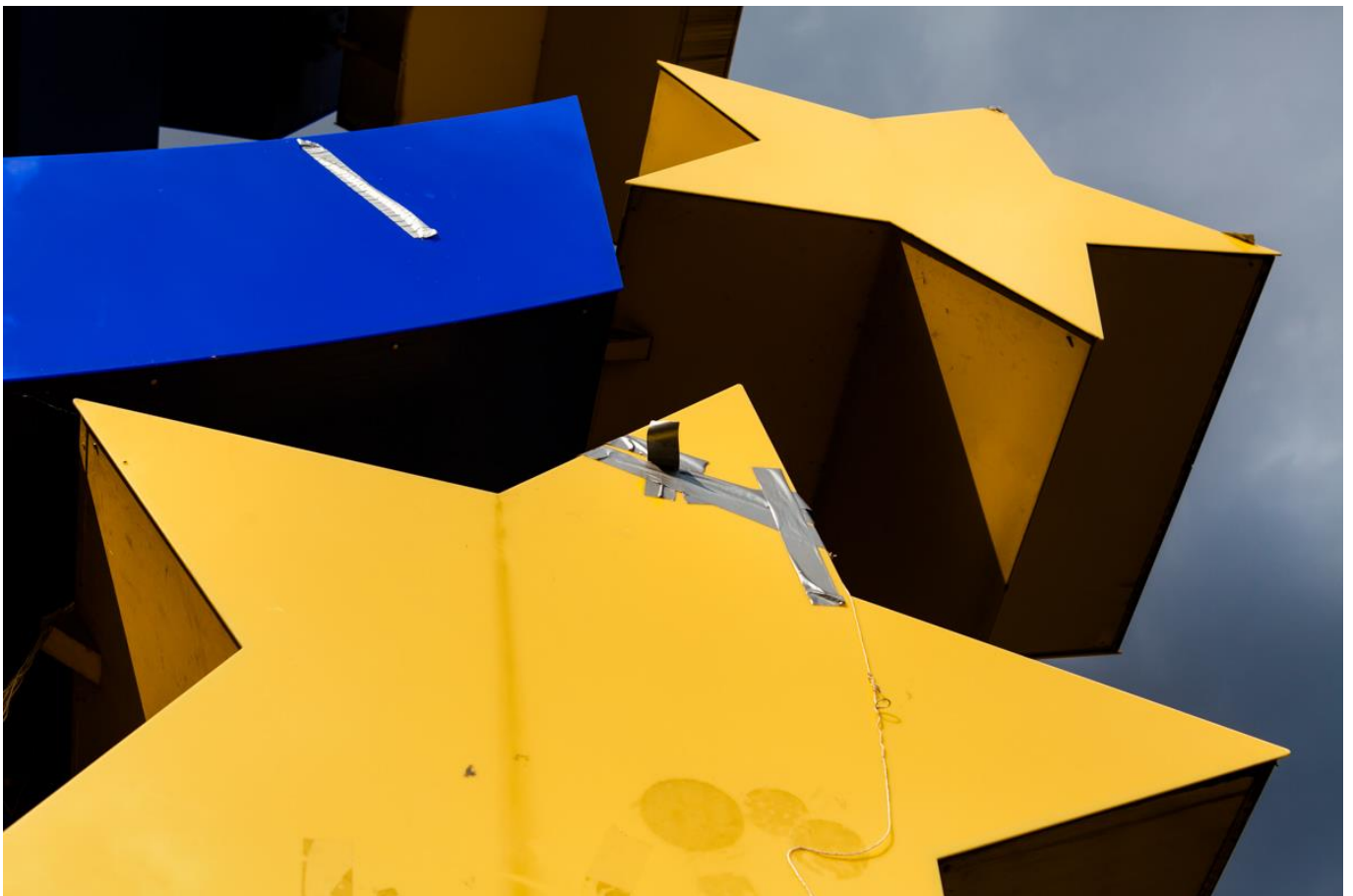
European Central Bank sign, from The Memory of History (2012)