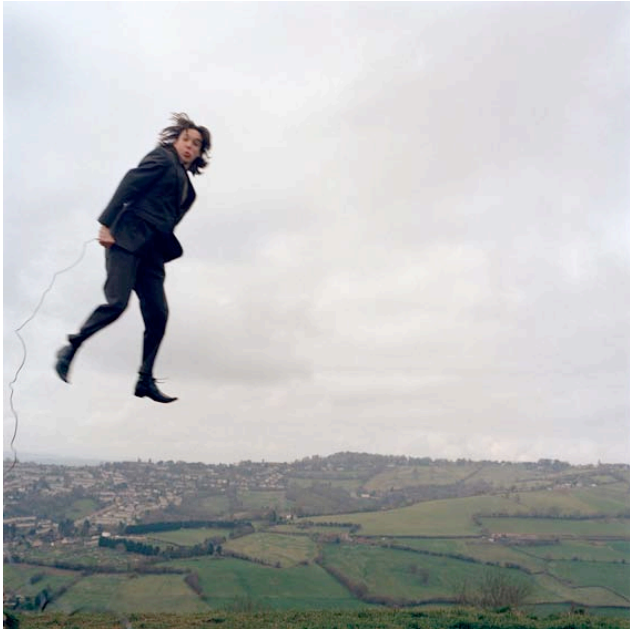
Over the Edge , 2008