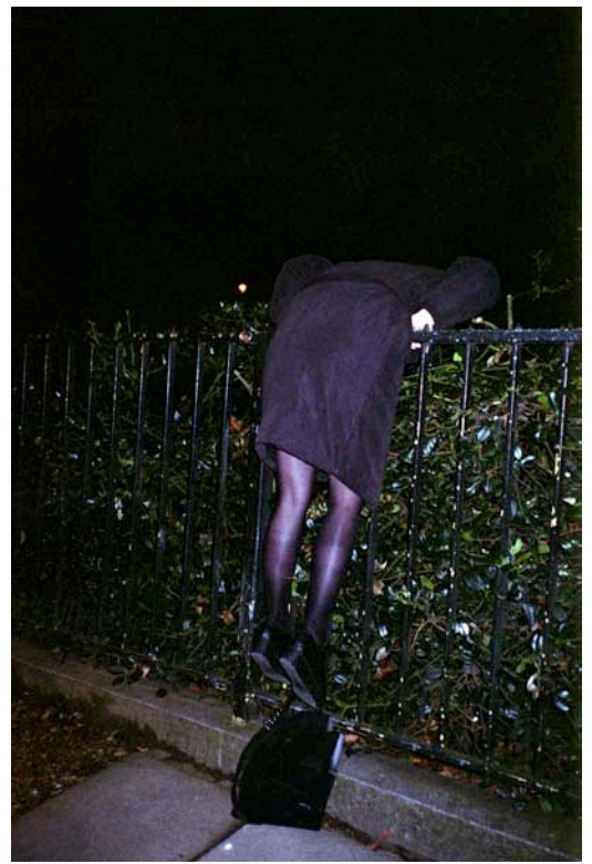
Invasion from the series Weak Anarchy , 2014