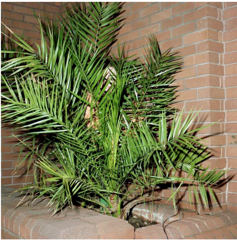
Watcha, Peeping Tommy from the series Weak Anarchy , 2014