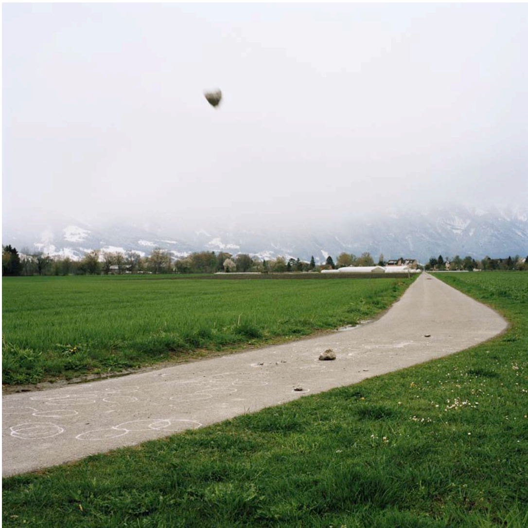
Tracking What Is from the series So It Goes , 2014