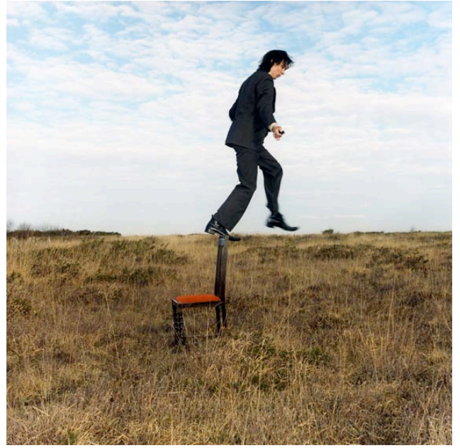
The Curious Search for Nothing , 2009