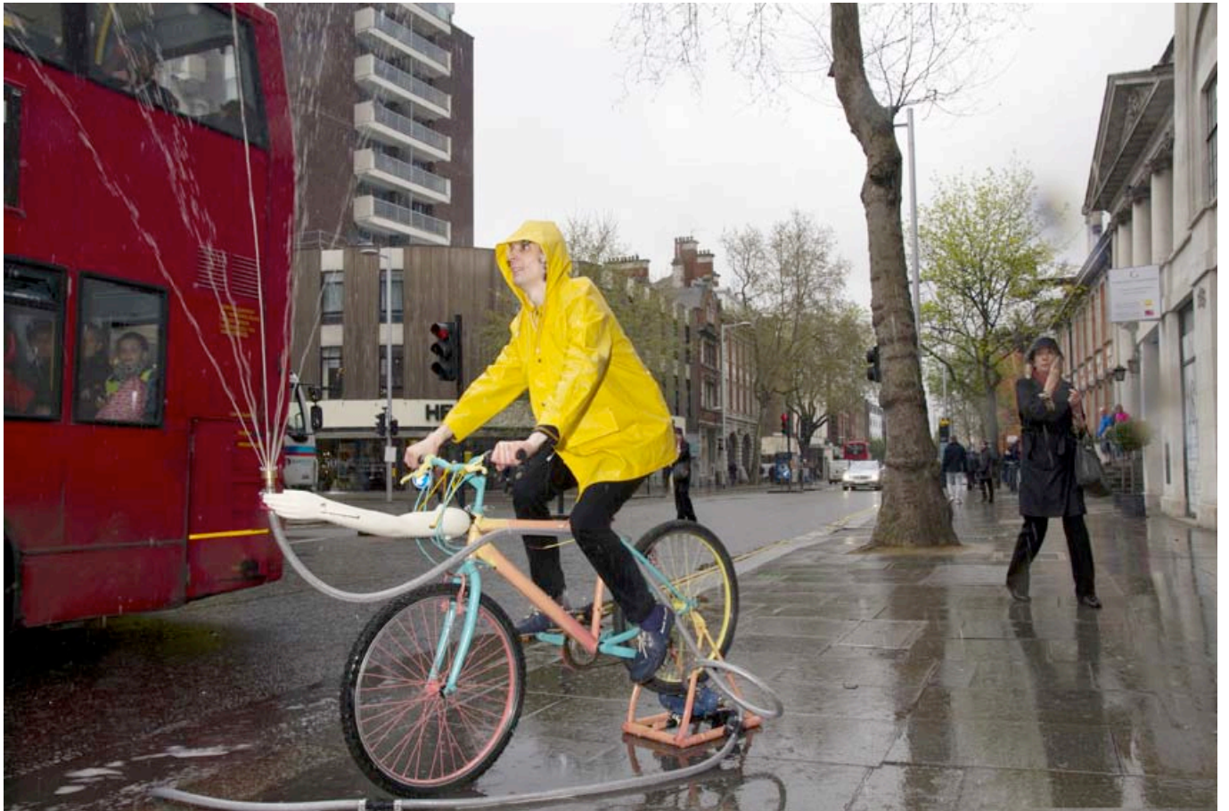
Fountain Bike (film still), 2014