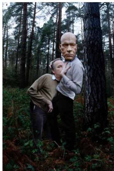
Reclaiming , 2011 - Father and self wearing wooden mask of Father's head