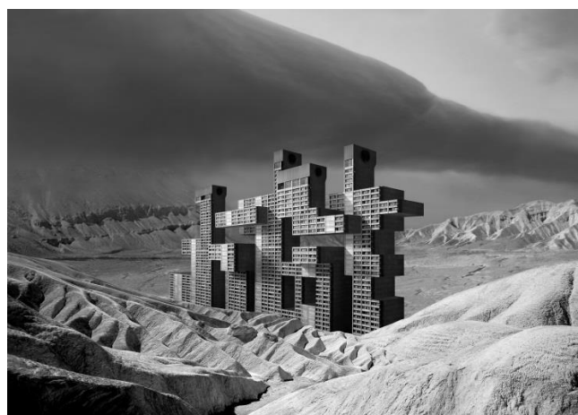
Landscape , series Fernweh, 2010