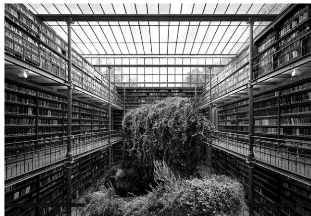
Museum Library , series Temples of Culture, 2014