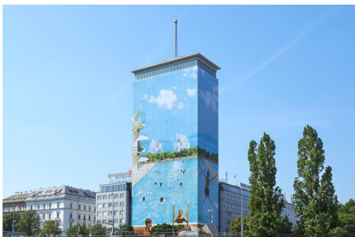
Sommerfreuden , 2015. Wrapping of Ringturm Tower, Vienna. Public art installation, size 4,000 msq