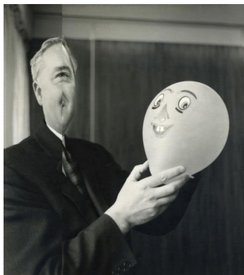
A Speculative Invisible Eye #3 , 2015 - Physically sliced and montaged photograph of Grandfather