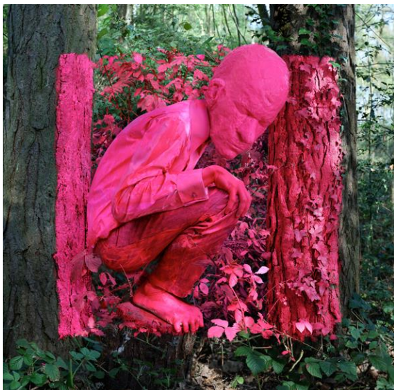
Natural Inside , 2011 – Self wearing up-scaled latex mask of my Father's head