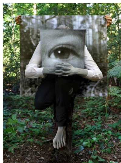
Untitled , 2016 - self painted grey, cradling photograph of eye as a child, obscuring my own eyes, in front of backdrop held by partner