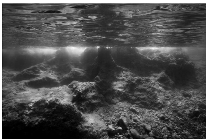
Sevid , series Saltwater, 2016