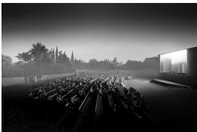
Screening , series Collective Narratives, 2012