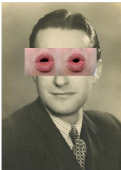
Envisionaries #11 , 2013 - My mouth during speech pinned over the eyes of my ancestors