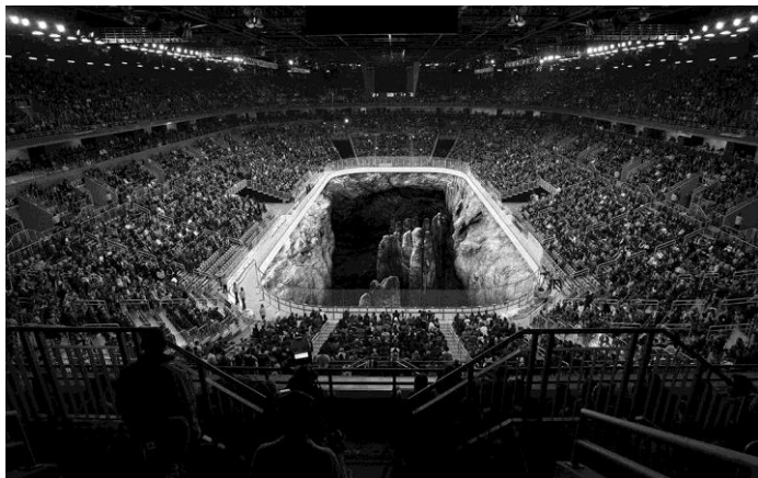
Arena , series Collective Narratives, 2013